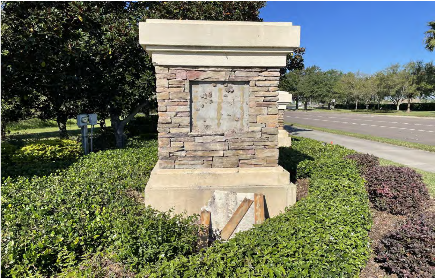
The decorative insert fell out of the column at Overpass and Angelstem.