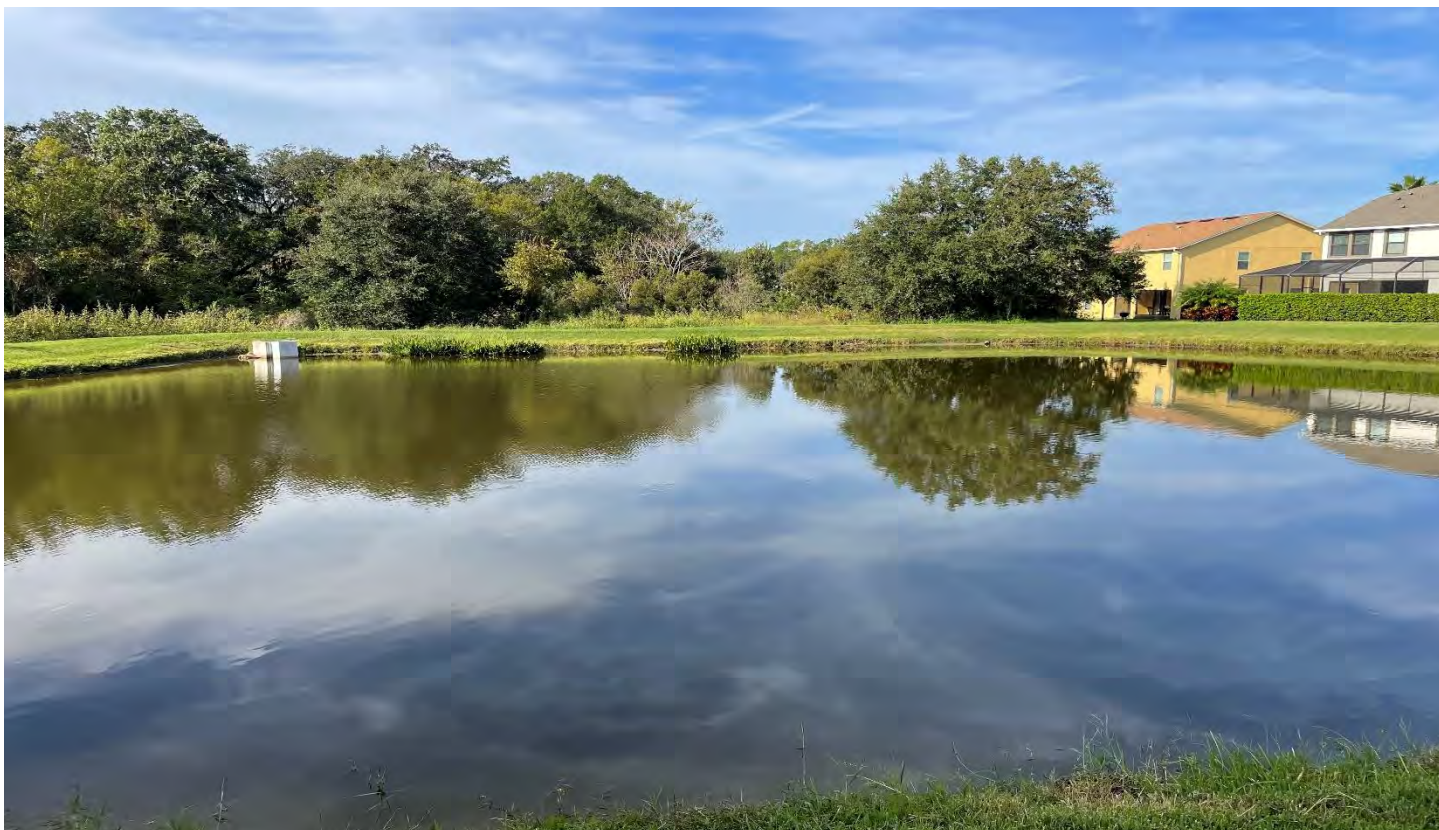
The other ponds are in good condition.