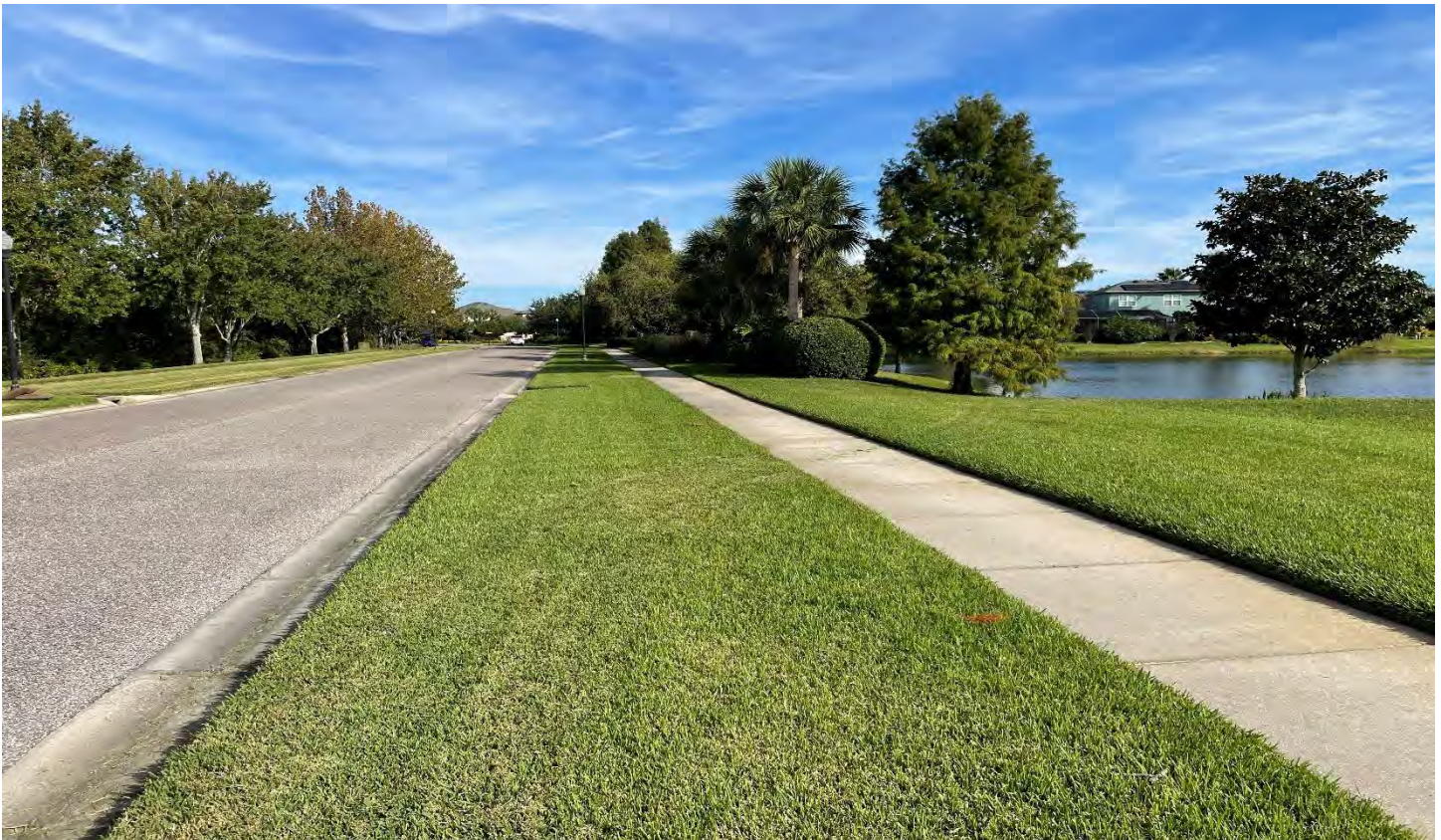
The turf along Angelstem is in good condition.