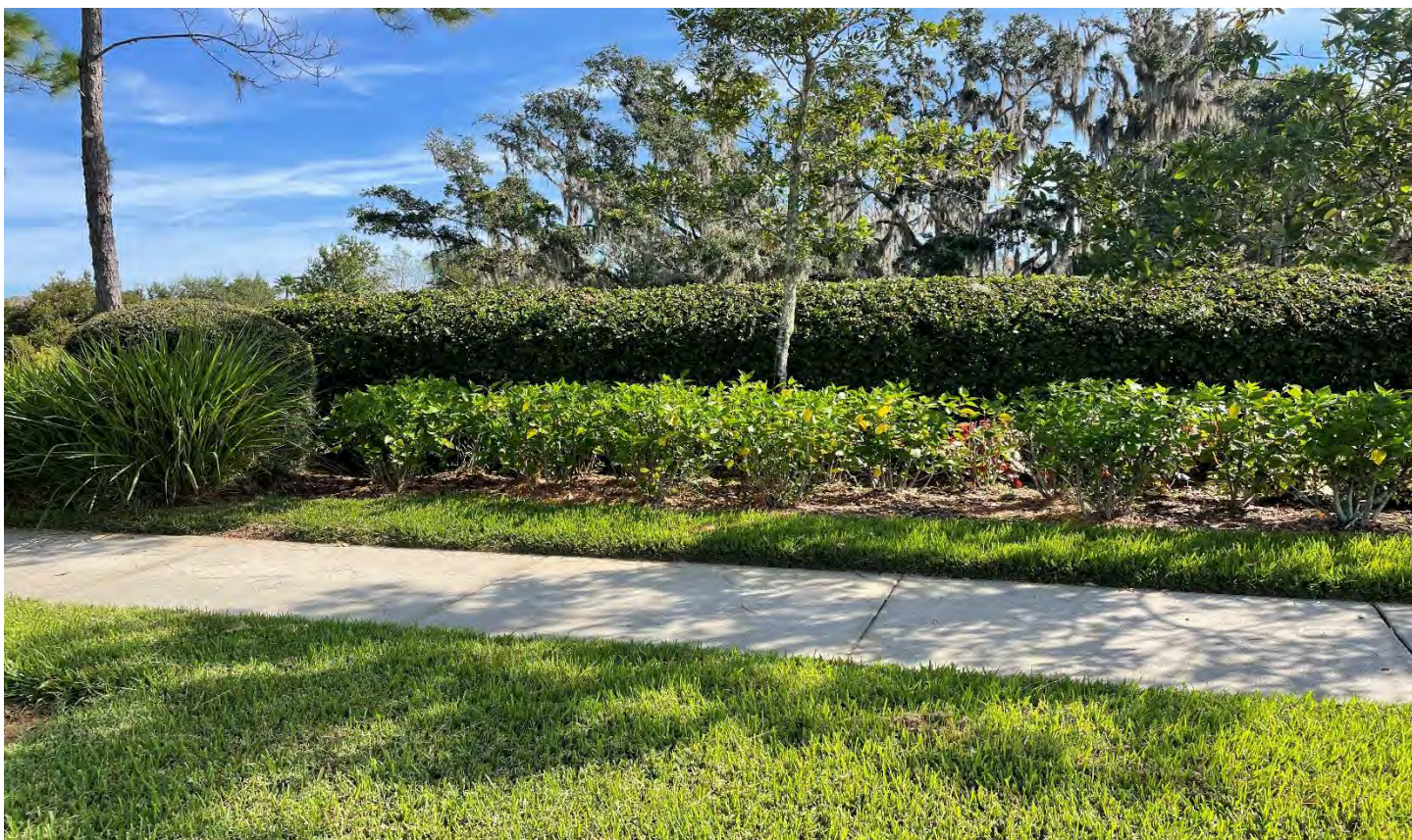
The Hibiscus plants along Angelstem need to be treated for fungus.