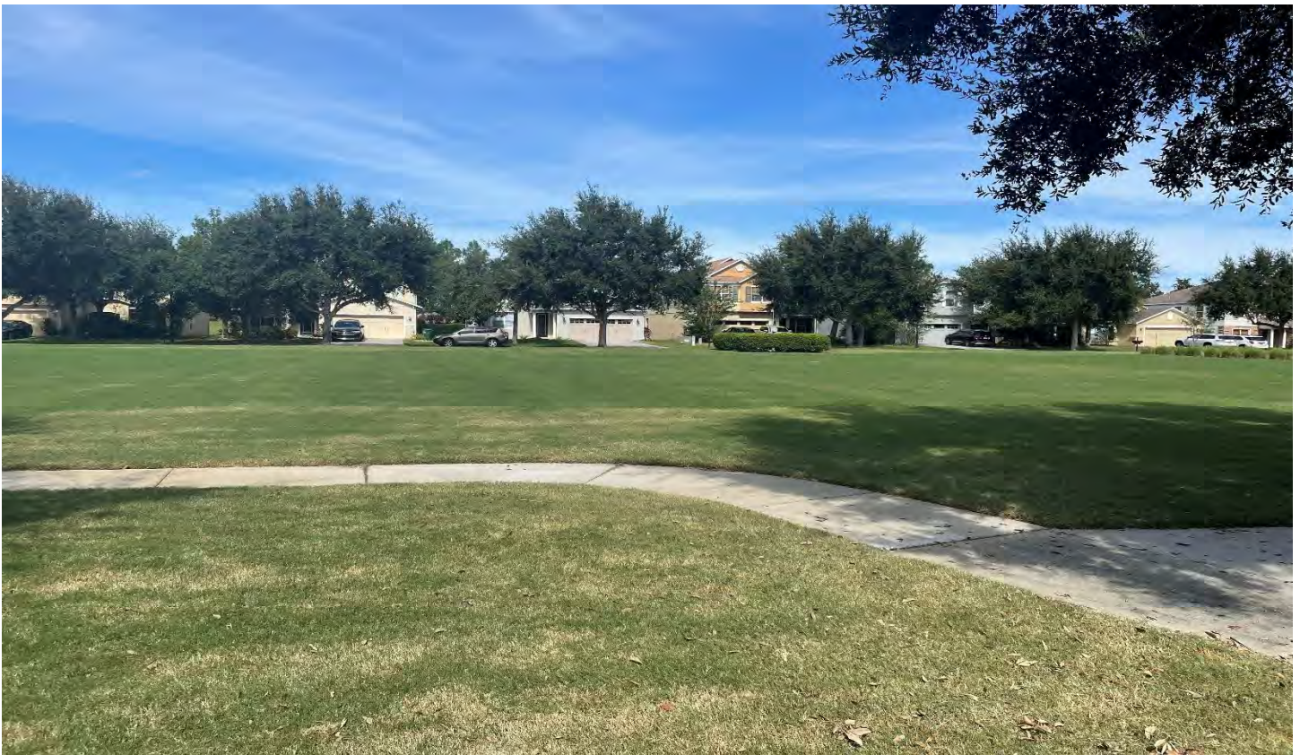
The turf at Seed Pod Park looks decent.