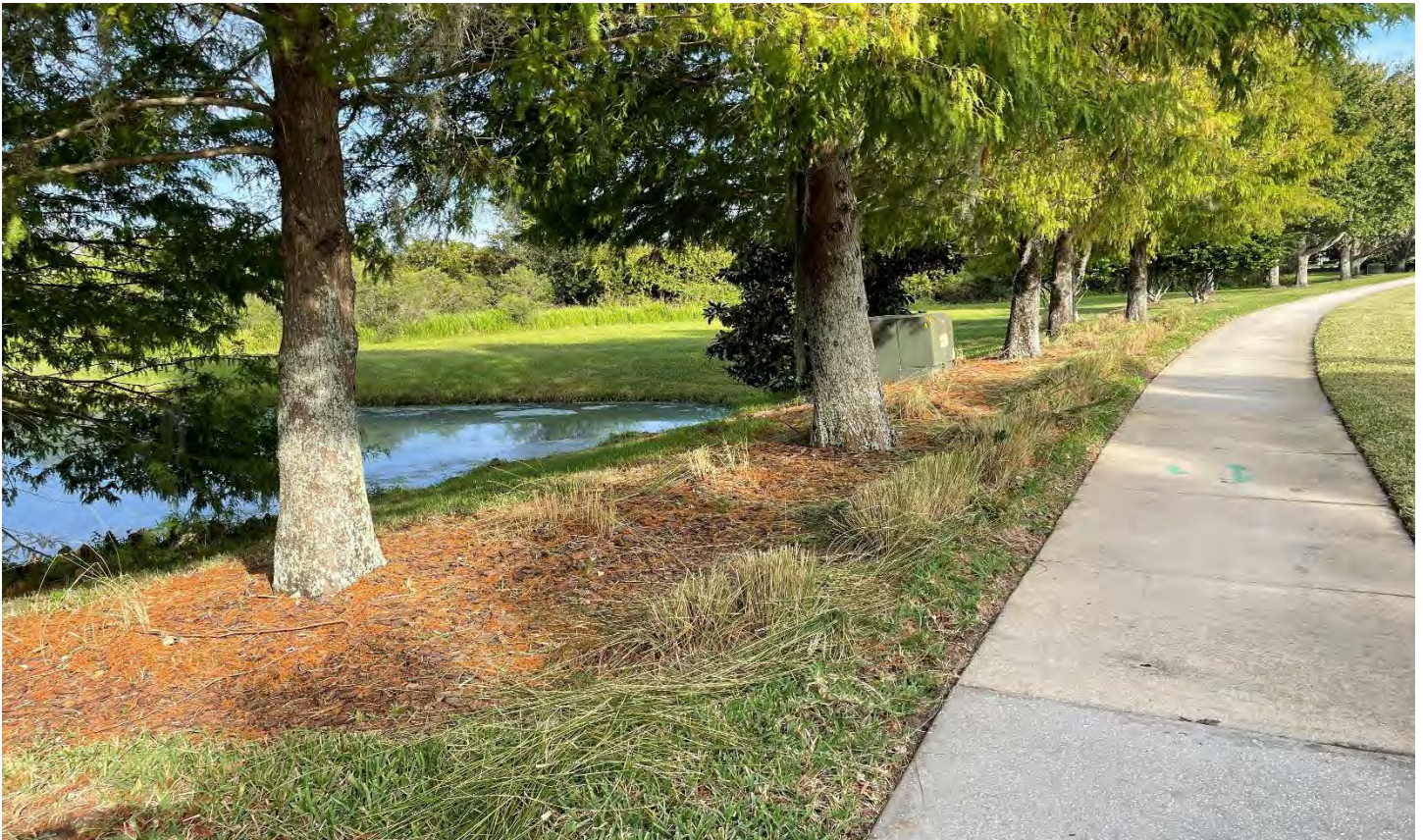
LMP is trimming all of the native grasses.