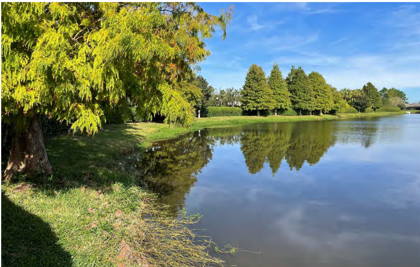
Pond 12 needs to be treated for Alligator weed.