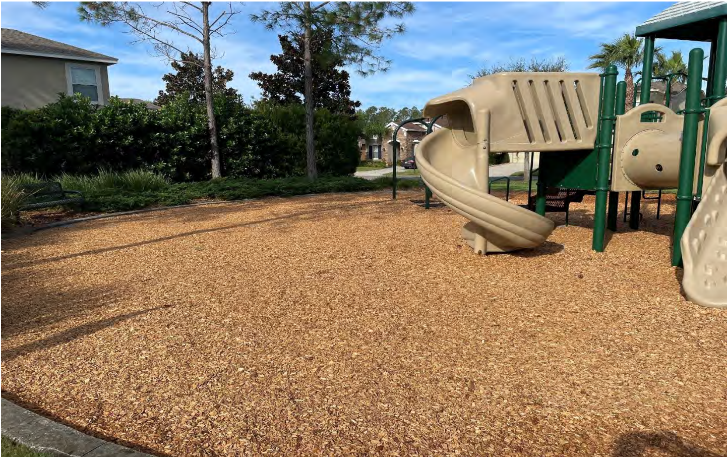
Fresh mulch has been added to the playgrounds.