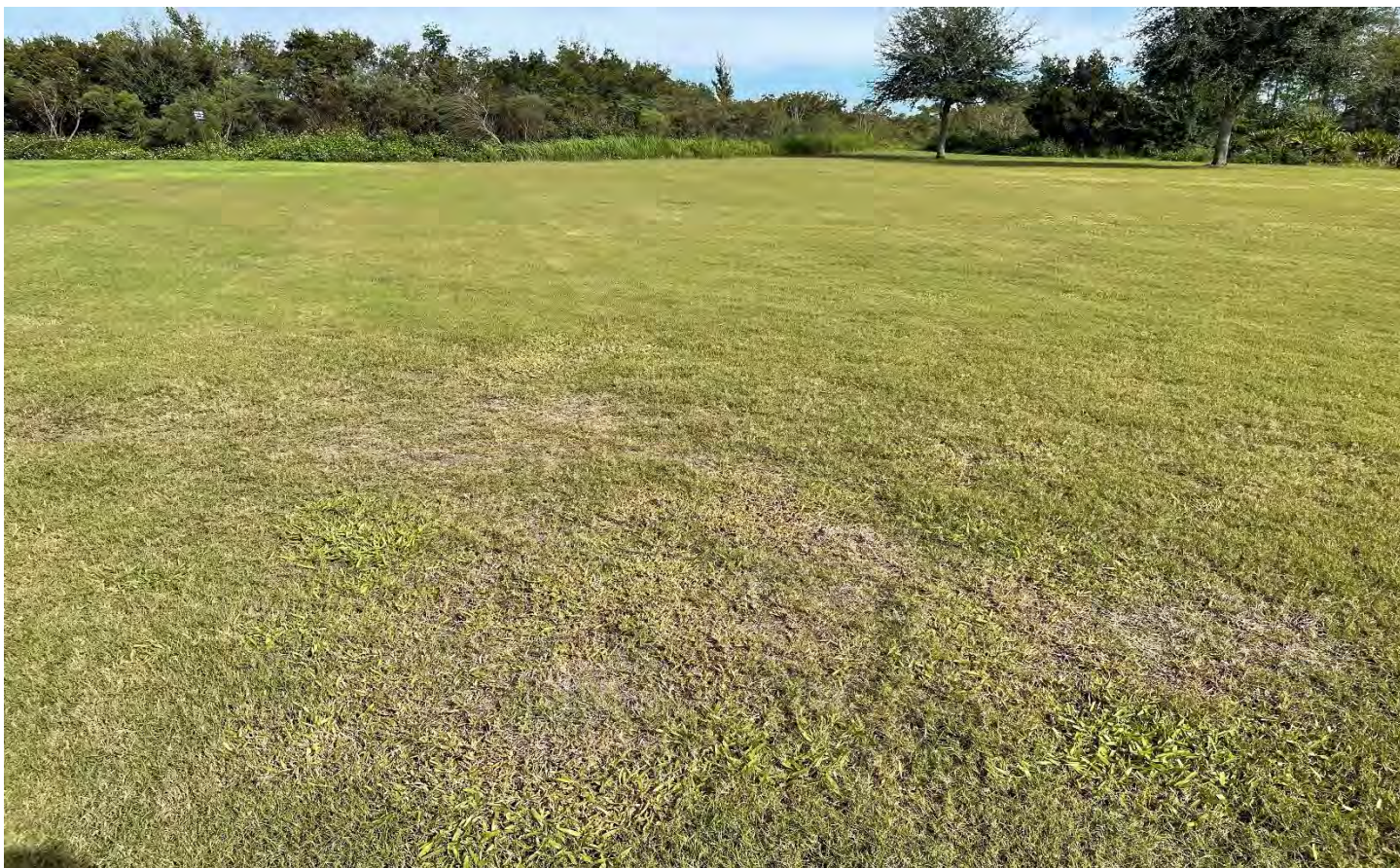
The turf at Silvercreek Park needs to be treated for mole crickets and crab grass.