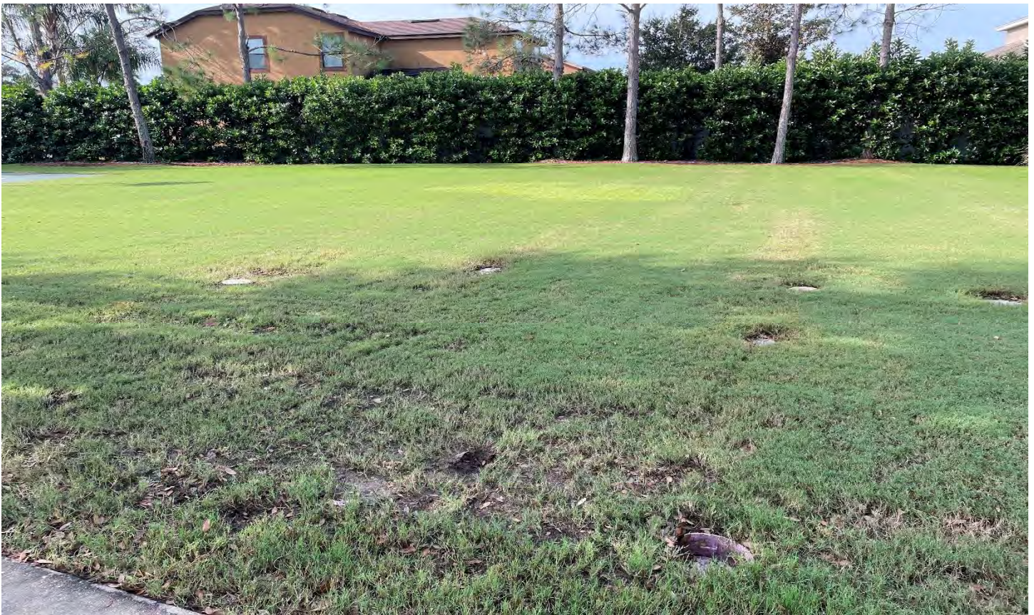
An area at the Glenbrook Park is still holding water.