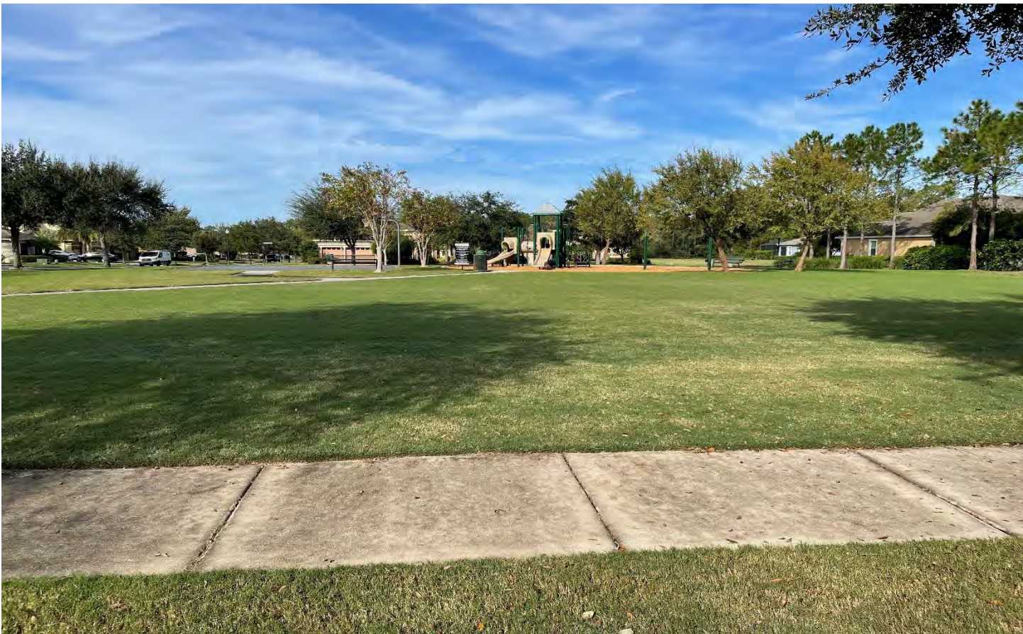
Weed control in the turf at Summerglade Park has improved.