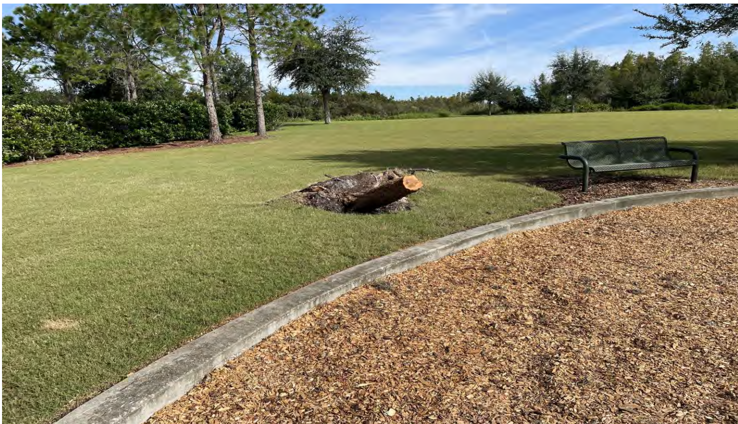
An Elm tree fell at the Silvercreek Park during the recent storm and needs to be removed.