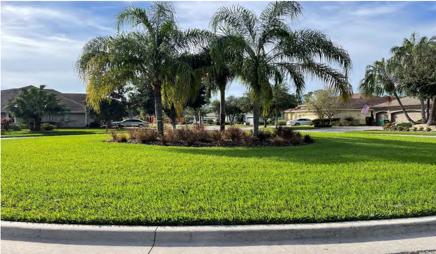
The landscape in the cul-de -sacs looks good.