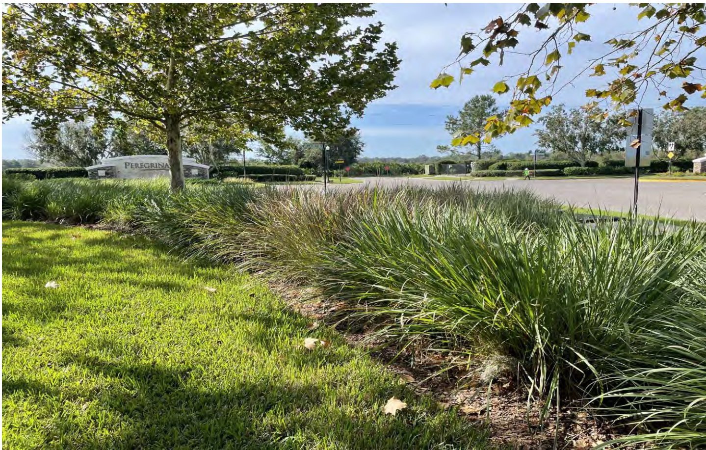
Fakahatchee grass along Angelstem needs to be treated for mites.