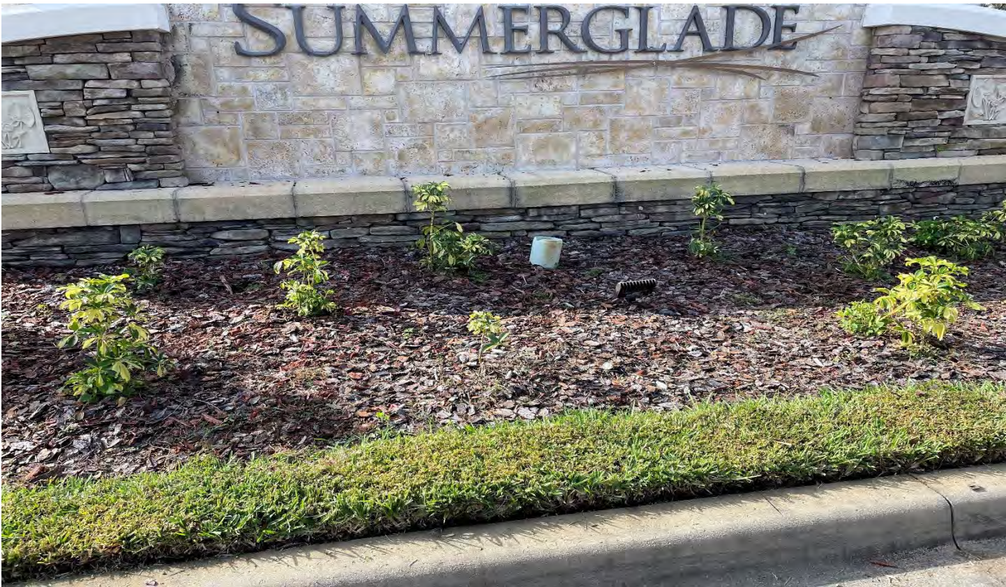
LMP will replace and upgrade some of the Arboricola at the Summerglade entrance.