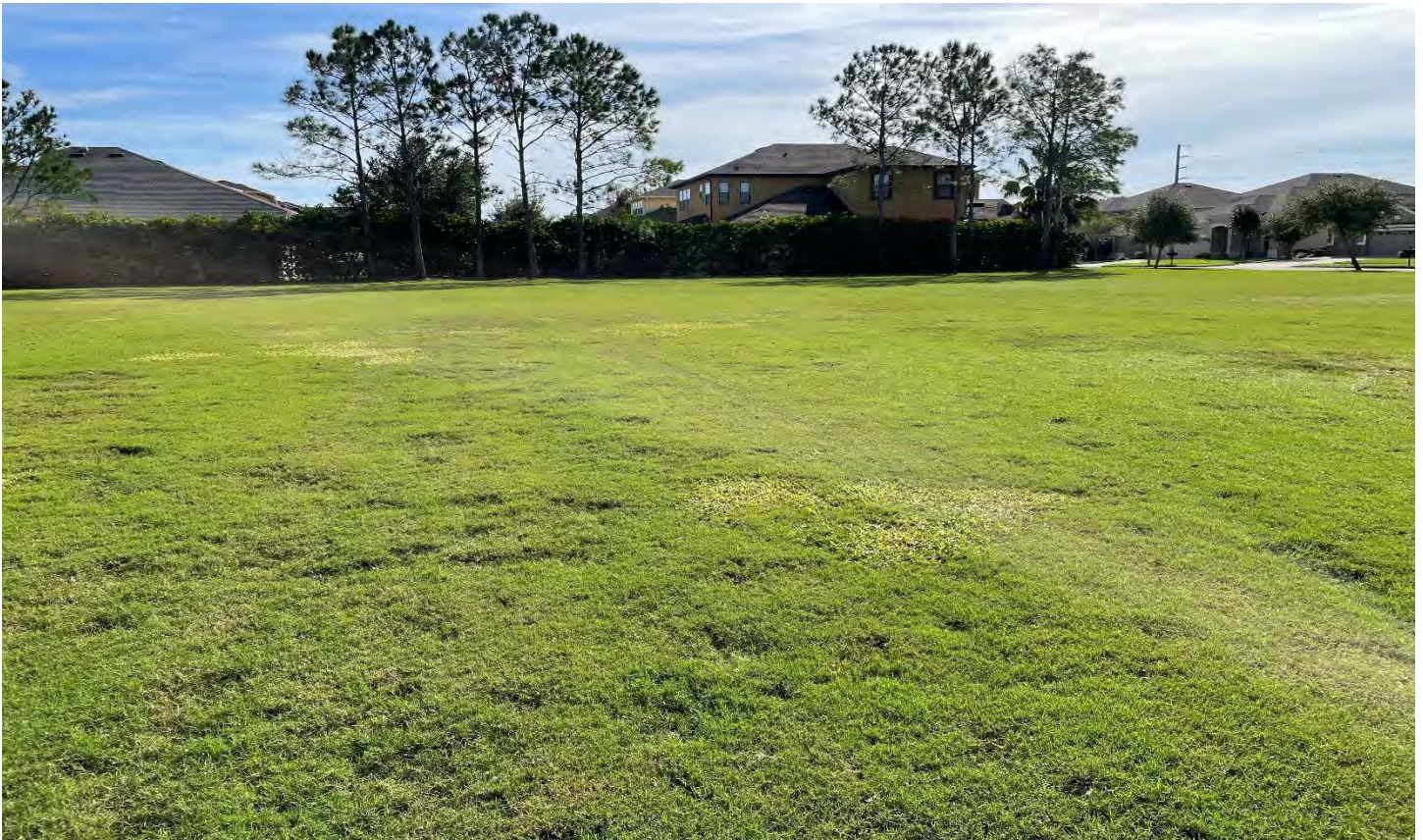
The turf at the Peregrina Park needs to be treated for Crab grass.