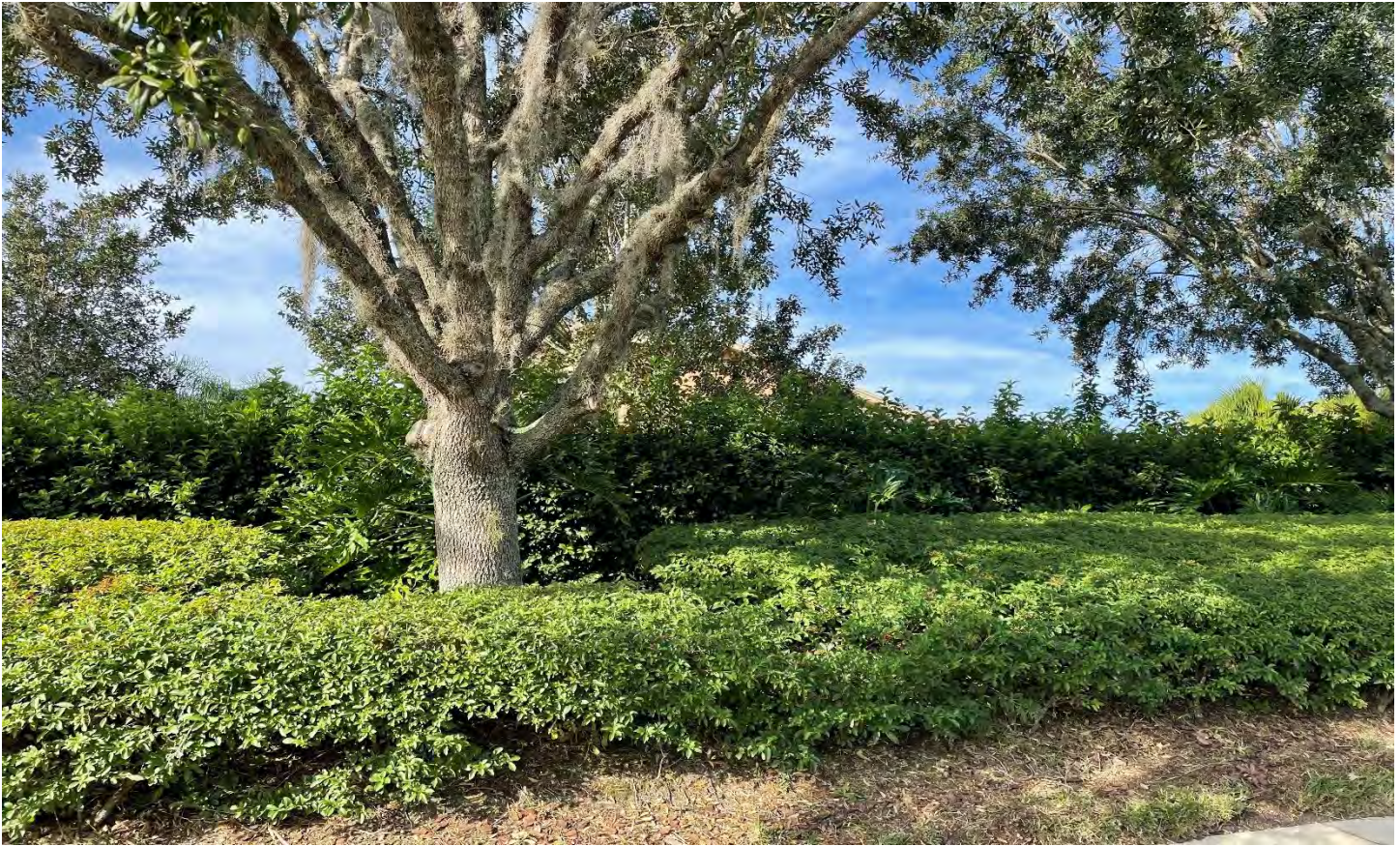
The Viburnum hedge along Angelstem needs to be trimmed.